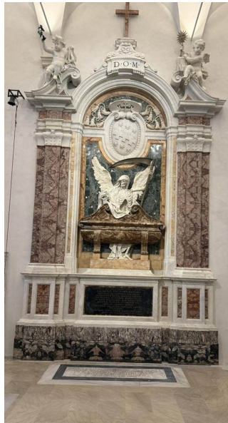
The tomb of Cardinal Cinzio Aldobrandini (1705–07): a winged skeleton of Death rising over the sarcophagus, carved by Pierre Le Gros the Younger.