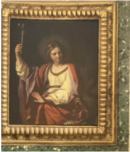
Saint Margaret of Antioch by Guercino (about 1644), in the right transept chapel — the saint raising a cross over the dragon she overcame.

Location: Piazza di San Pietro in Vincoli, Esquiline Hill, Rome