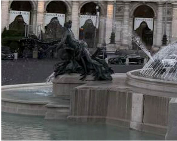
Detail (zoomed) — a Naiad reclining on her aquatic creature on the left of the basin.